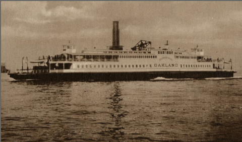
“Southern Pacific [Railroad] Ferry Boat Plying Between San Francisco And Oakland”